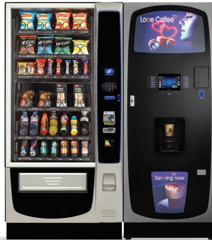
Merchant Media 4 Keypad shown fitted with optional base graphic and MEI Cashless reader.