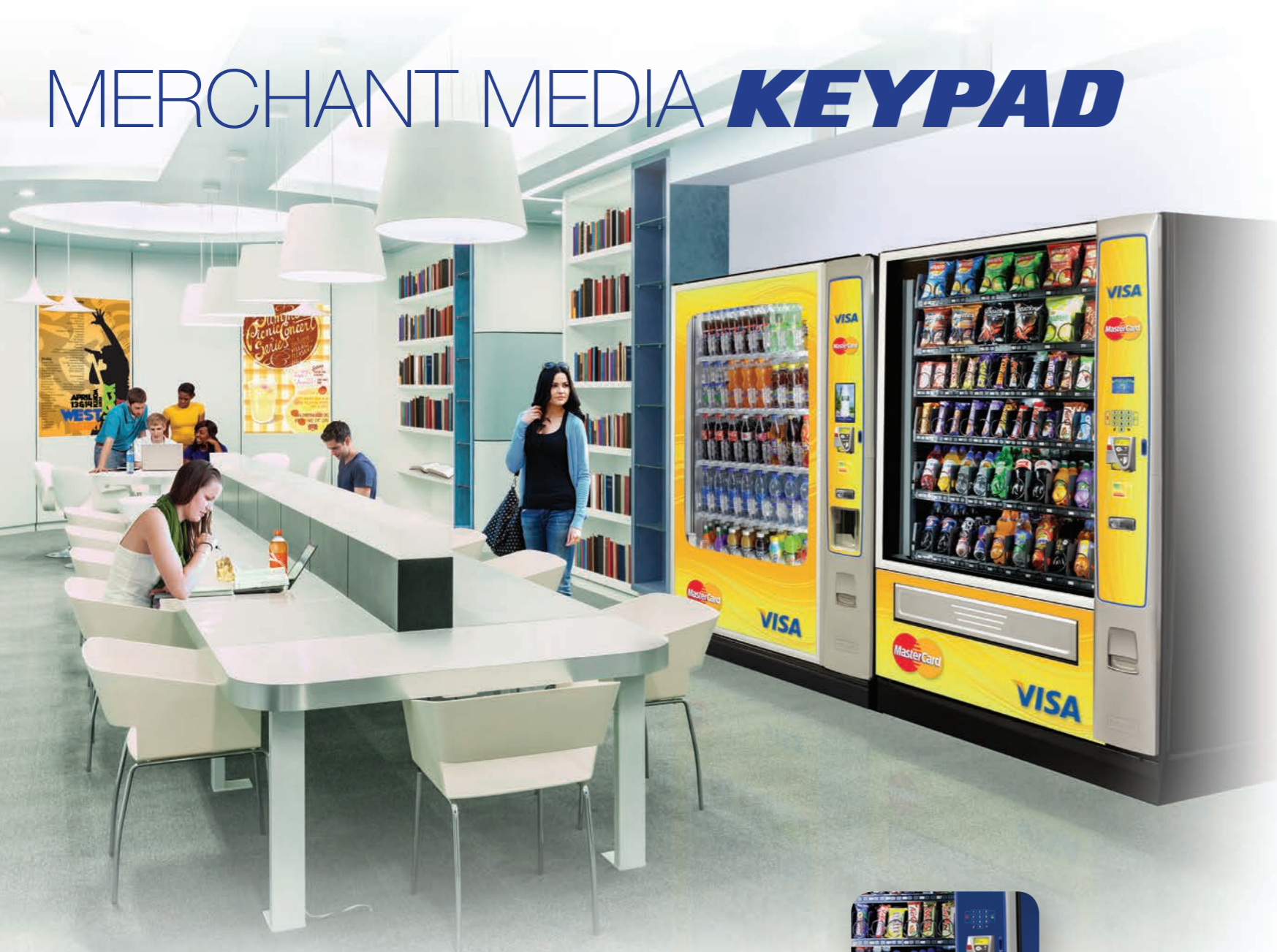
N.B. Image above shows example of machine branding.